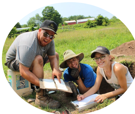
Field students at the 2015 Pethick site excavations, Schoharie, NY.